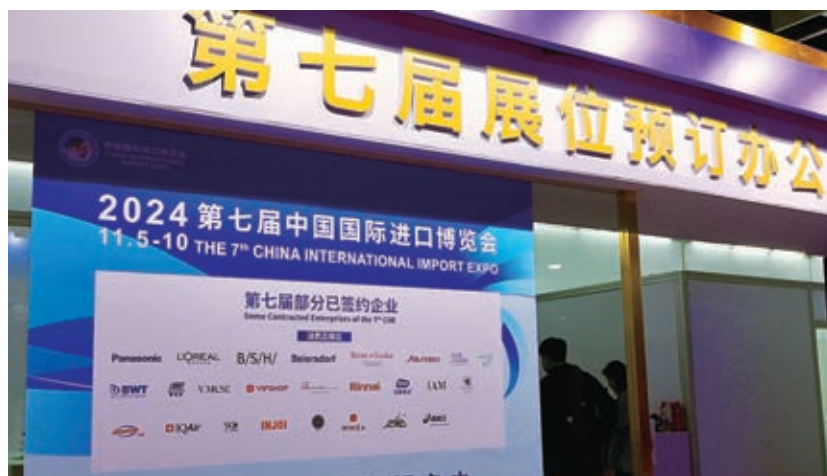
As the curtains fell on the sixth CIIE, preparations for the seventh edition have already commenced. — Dong Jun

Specifically, the Country Exhibition drew praise for promoting communication and cooperation among nations at various developmental stages. Eleven countries made their debut for the CIIE, injecting a fresh vibrancy into the event. The China pavilion, themed "Chinese modernization creates